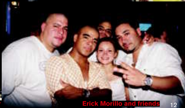
Erick Morillo and friends