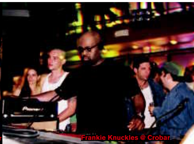
Frankie Knuckles @ Crobar