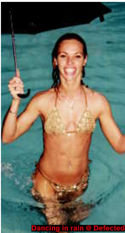
Dancing in rain @ Defected