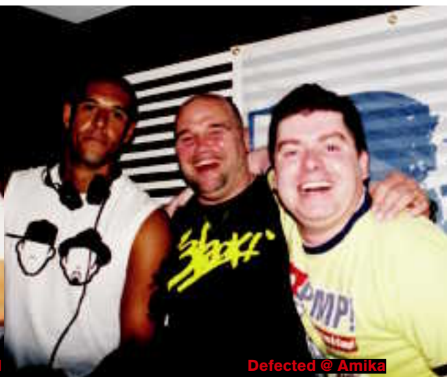
Defected @ Amika