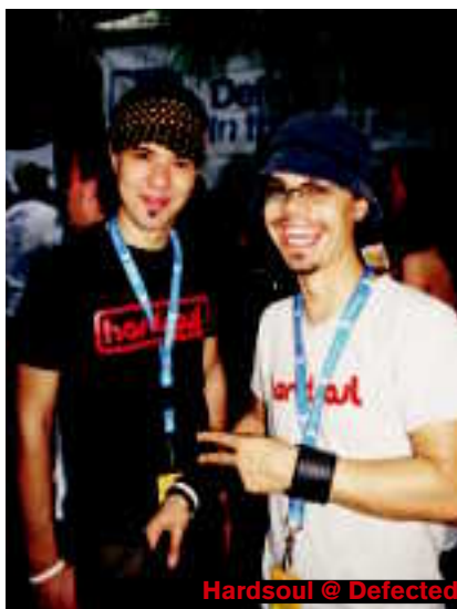
Hardsoul @ Defected