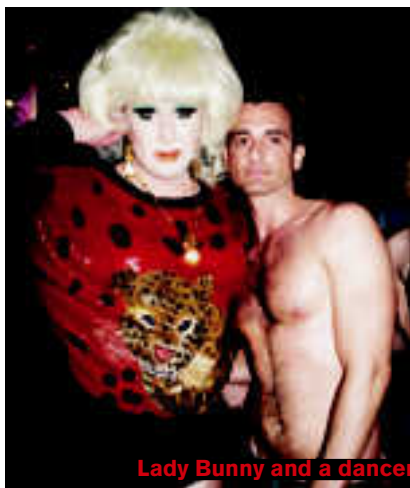
Lady Bunny and a dancer