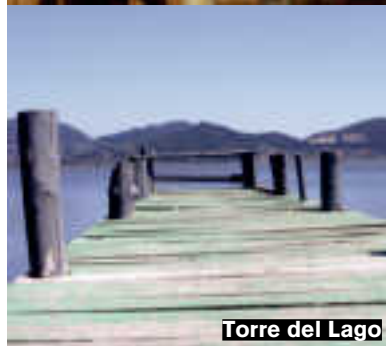
Torre del Lago