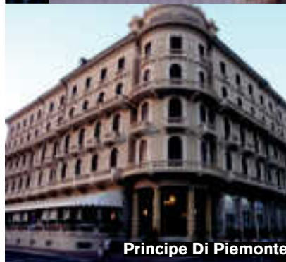
Principe Di Piemonte